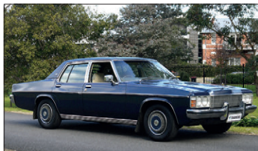
LOT 38 1975 HOLDEN HJ STATESMAN CAPRICE SEDAN $4 - 7,000