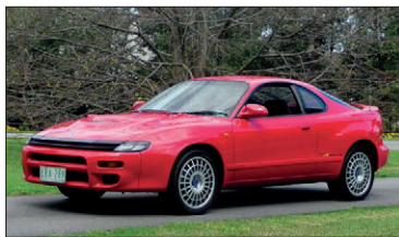
LOT 42 1991 TOYOTA CELICA GT-FOUR GROUP A RALLYE COUPE (CARLOS SAINZ NO. 045) $12 - 16,000