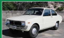
1969 Mazda R100 Coupe Guiding Range $34 - $40,000