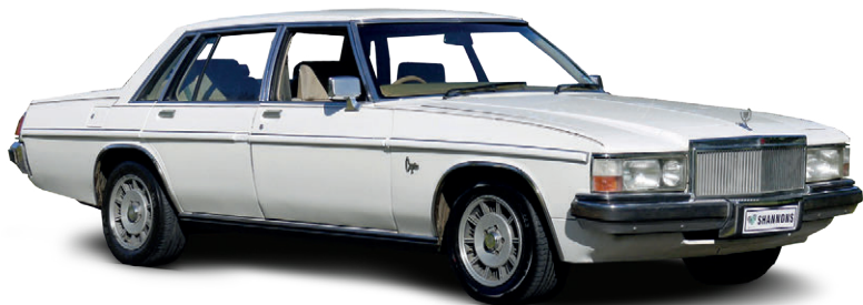
LOT 39 1983 HOLDEN WB STATESMAN CAPRICE SEDAN