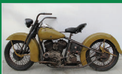
1941 Harley-Davidson U Model 1200cc Motorcycle Guiding Range $16 - $21,000