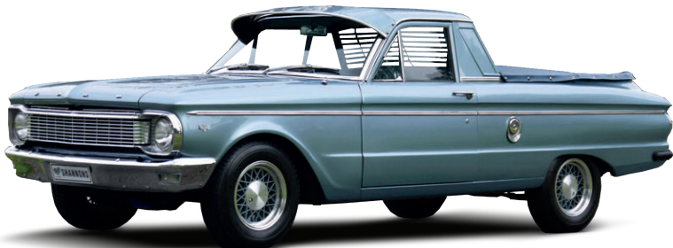
LOT 11 1965 FORD FALCON XP UTILITY