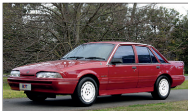
LOT 40 1986 HOLDEN HDT VL COMMODORE 'NITRON' SEDAN $7 - 9,000