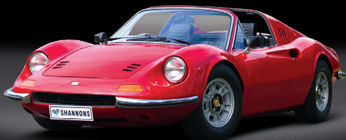
1974 FERRARI DINO 246 GTS SPYDER