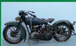
1929 Harley-Davidson JDH 1200cc (Two Cam) Guiding Range $23 - $28,000