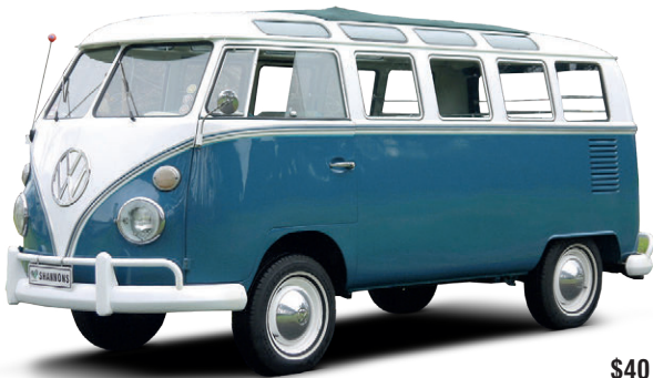
LOT 6 1966 VOLKSWAGEN 21 -WINDOW MICROBUS (LHD)