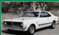
1969 Holden HT GTS Monaro 350 Coupe Guiding Range $80 - $88,000