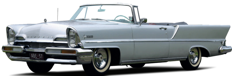
LOT 21 1957 LINCOLN PREMIER CONVERTIBLE (LHD)