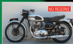
1956 Triumph Tiger 100 500cc Motorcycle Guiding Range $8 - $12,000