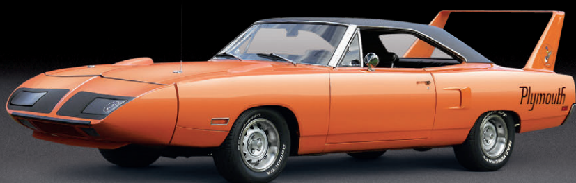
1970 PLYMOUTH SUPERBIRD 440 SIX PACK 'ROADRUNNER' COUPE (LHD)