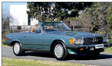
LOT 41 1987 MERCEDES-BENZ 560SL CONVERTIBLE $12 - 16,000