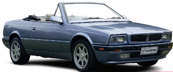
LOT 43 1994 MASERATI BI-TURBO SPYDER