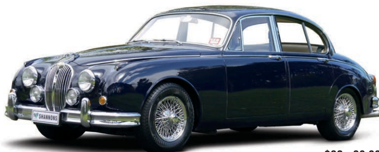
LOT 10 1964 JAGUAR MK II '4.2 IMPROVED' SALOON