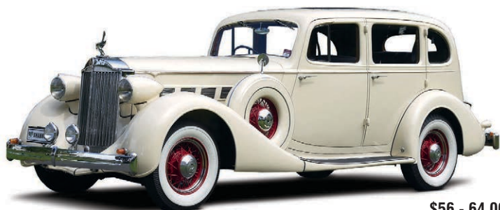
LOT 21 1935 PACKARD SUPER EIGHT SEDAN (RHD)