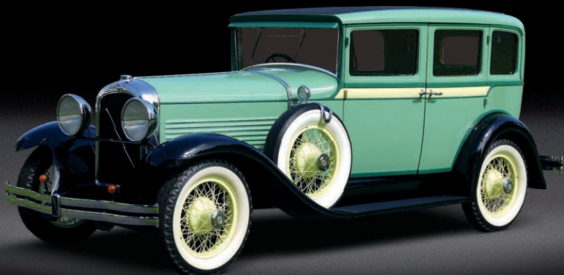
1929 MARMON MODEL 78 'STRAIGHT 8 OHV' SEDAN (RHD)