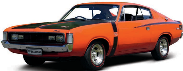
LOT 38 1971 CHRYSLER VH VALIANT E38 CHARGER COUPE $75 - 85,000 $