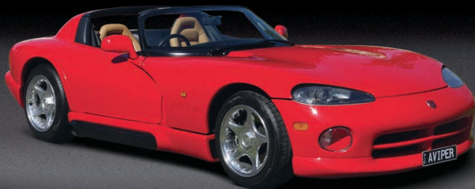
LOT 16 1993 DODGE VIPER RT/10 ROADSTER $74 - 82,000 $