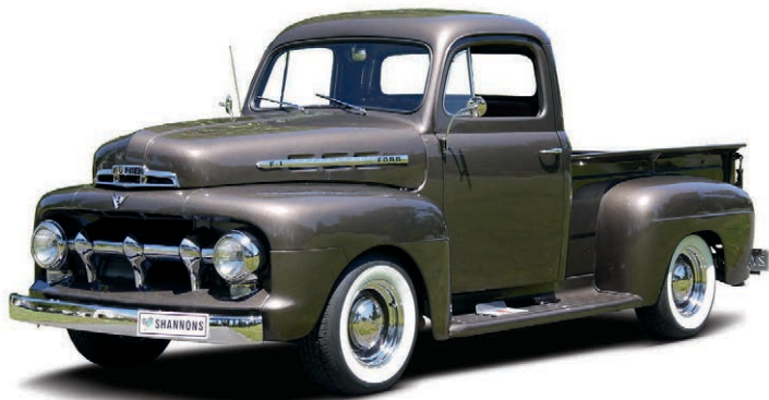
LOT 39 1951 FORD F1 'MODIFIED' PICK-UP (LHD) $30 - 34,000 $