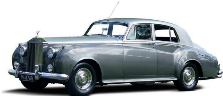
LOT 9 1961 ROLLS-ROYCE SILVER CLOUD II SALOON