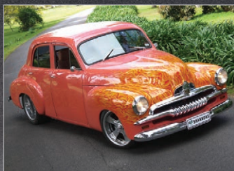
LOT 15 1953 HOLDEN FJ MODIFIED 'STREET MACHINE' SEDAN $48 - 54,000 $