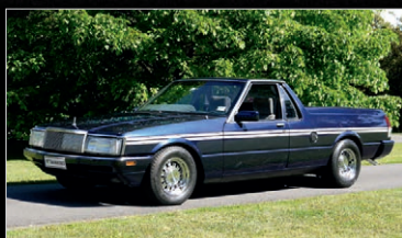
LOT 18 1981 FORD FALCON XD 351ci V8 UTILITY $7 - 10,000 $