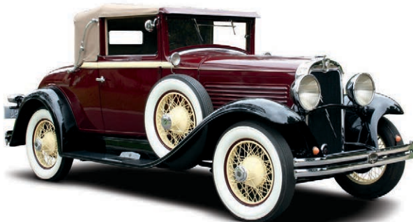
LOT 22 1929 MARMON ROOSEVELT 'STRAIGHT 8' COLLAPSIBLE COUPE (RHD)