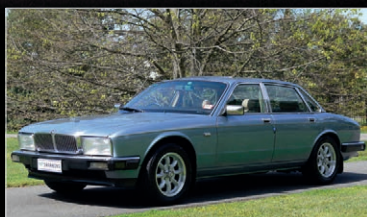
LOT 17 1988 JAGUAR SOVEREIGN SALOON NO RESERVE $5 - 8,000 $