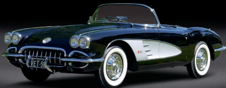
1958 CHEVROLET CORVETTE ROADSTER (RHD)