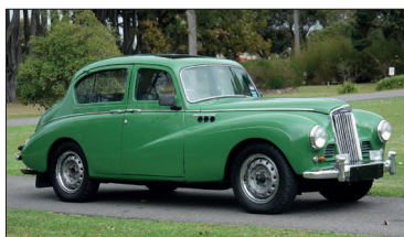
LOT 23 1953 SUNBEAM TALBOT MARK IIA SALOON $6 - 9,000