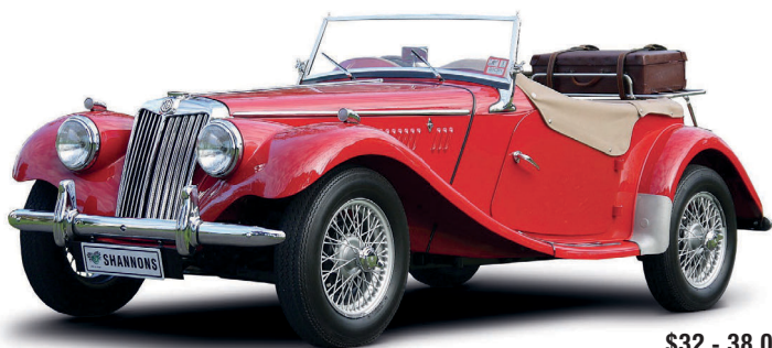
LOT 21 1954 MG TF 1250 ROADSTER