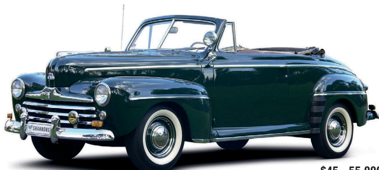
LOT 22 1948 FORD DELUXE CONVERTIBLE (LHD)