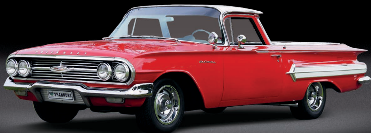
LOT 30 1960 CHEVROLET EL CAMINO UTILITY (LHD) $15 - 20,000 $