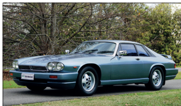
LOT 18 1989 JAGUAR XJS 'TWR KIT' COUPE NO RESERVE $7 - 10,000