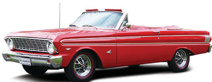
LOT 38 1964 FORD FUTURA CONVERTIBLE (LHD)