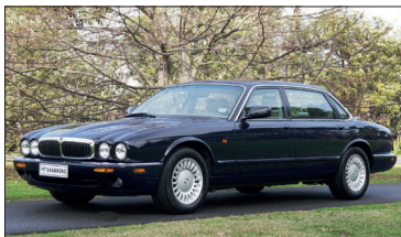
LOT 40 1999 JAGUAR XJ8 3.2 V8 SALOON