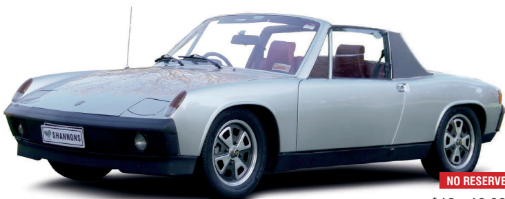
LOT 37 1972 PORSCHE 914 'TARGA' COUPE (RHD)