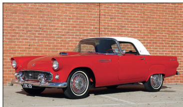
LOT 39 1955 FORD THUNDERBIRD CONVERTIBLE (LHD)