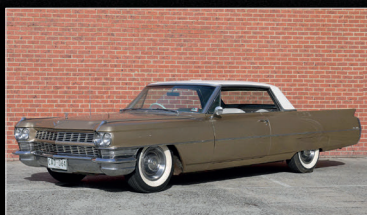
LOT 31 1964 CADILLAC COUPE DEVILLE (RHD) $14 - 18,000 NO RESERVE $