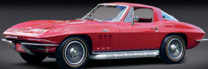
1966 CHEVROLET CORVETTE 427/390HP COUPE (LHD)