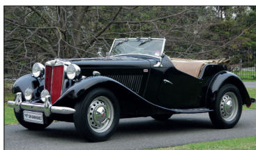
LOT 20 1953 MG TD2 ROADSTER $25 - 30,000