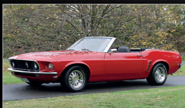
LOT 32 1969 FORD MUSTANG CONVERTIBLE (RHD) $32 - 38,000 $