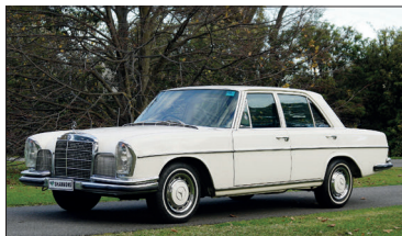
LOT 19 1971 MERCEDES-BENZ 280SE 3.5 SALOON $8 - 12,000