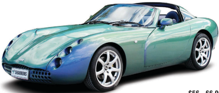
LOT 15 2003 TVR TUSCAN MK1 TARGA CONVERTIBLE