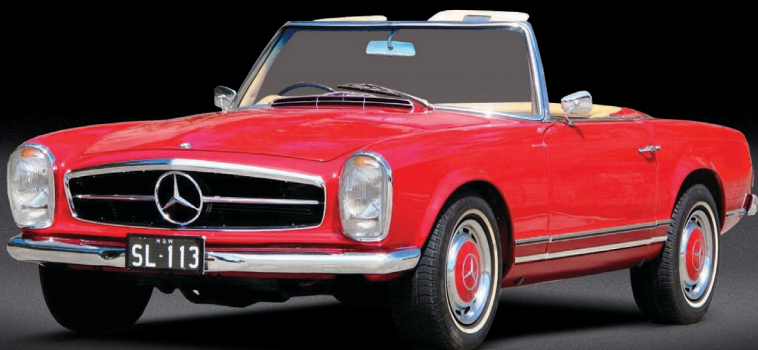
1964 MERCEDES-BENZ 230SL CONVERTIBLE