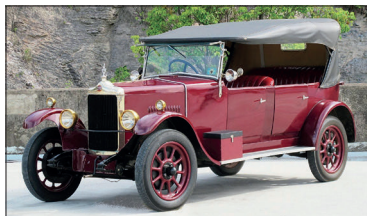
LOT 13 1927 STANDARD COVENTRY OPEN TOURER