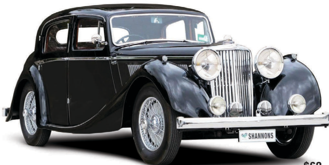
LOT 16 1939 SS JAGUAR 2½ LITRE SALOON