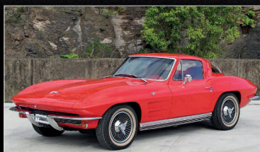
LOT 19 1964 CHEVROLET CORVETTE STINGRAY COUPE (LHD) $52 - 62,000 $