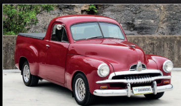
LOT 22 1956 HOLDEN FJ UTILITY (MODIFIED) NO RESERVE $12 - 16,000 $