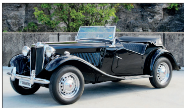
LOT 18 1952 MG TD ROADSTER