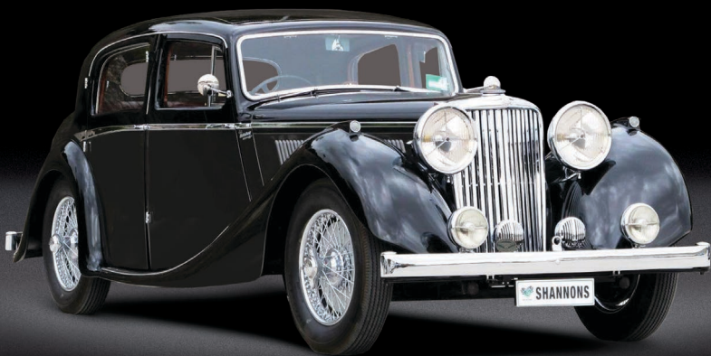
1939 SS JAGUAR 2½ LITRE SALOON