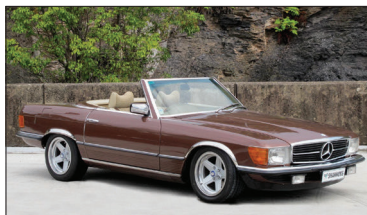
LOT 17 1978 MERCEDES-BENZ 350SL CONVERTIBLE