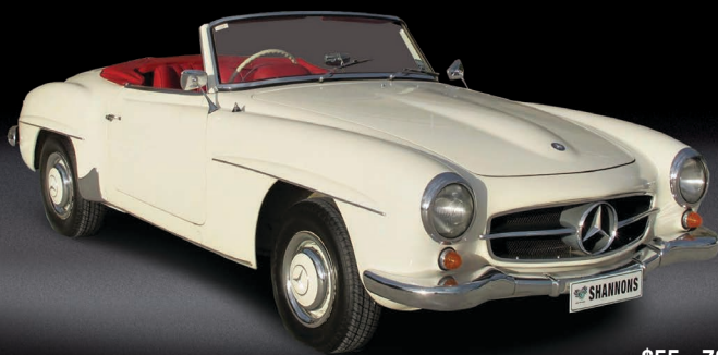
LOT 20 1959 MERCEDES-BENZ 190SL ROADSTER $55 - 70,000 $