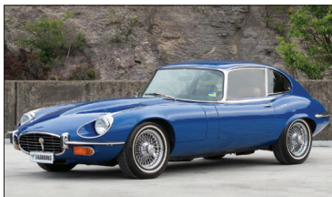
LOT 14 1972 JAGUAR E-TYPE SERIES 3 V12 COUPE